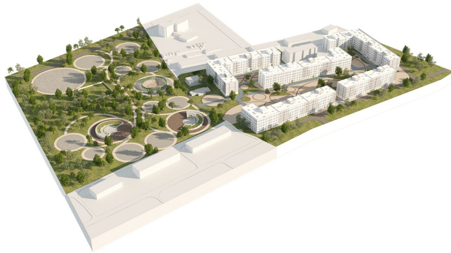
“Steel Dream. Hlukhiv”