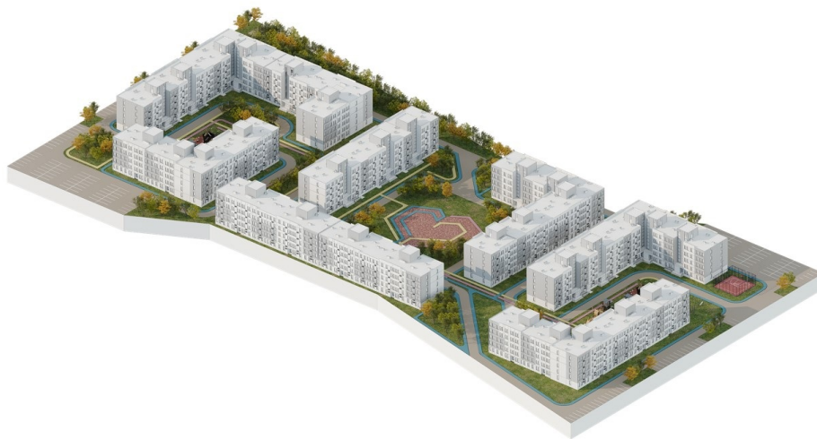
“Steel Dream. Mariupol-Vasylkiv”

The Steel Dream concept offers a suite of ready-to-implement solutions for housing, social infrastructure and commercial premises. A community can choose a project, adapt it to its needs, secure funding and start building immediately. Specialists have produced more than 200 ready-made designs based on three prefabricated steel elements: frame, module and platform. Each is accompanied by a full set of documentation: cost estimates, construction schedules, layout plans and technical specifications.