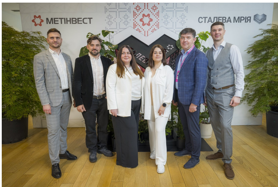
The Steel Dream Team

“Our project is intended to be a vital tool for rebuilding infrastructure and providing high-quality housing. It is more than a residential complex; it is an integrated system that meets the challenges of the modern age. The modular steel-frame building is quick to erect, built to last and adaptable to future needs,” said Tkachenko.